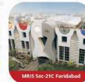
MRIS Sec-21C Faridabad