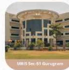
MRIS Sec-51 Gurugram