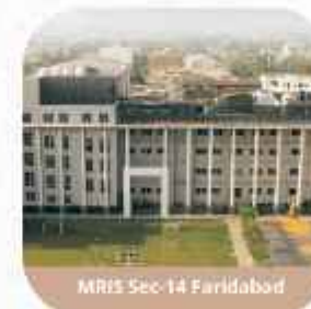
MRIS Sec-14 Faridabad