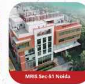
MRIS Sec-51 Noida