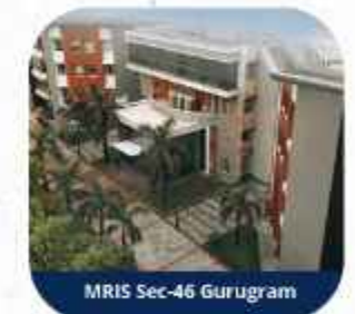
MRIS Sec-46 Gurugram